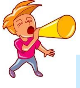
Marilyn Bailey, Property Manager

As of August 1, 2019, lot rent will be increasing for current residents. The new rate for lakefront is $593.06, perimeter and corner are $538.00, and for interior $499.00. Trash pick up will be also be added at approximately $11.00 to $12.00 per month.